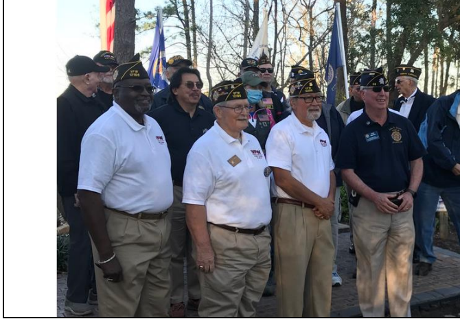
Members of VFW Post 12196 and American Legion Post 68