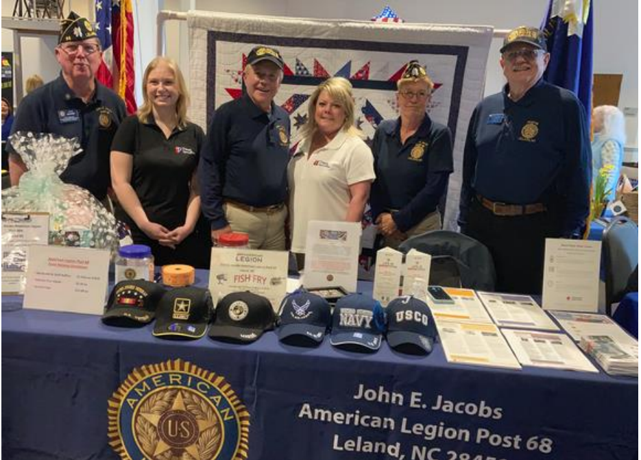
Chamber of Commerce Expo: Feb 26th