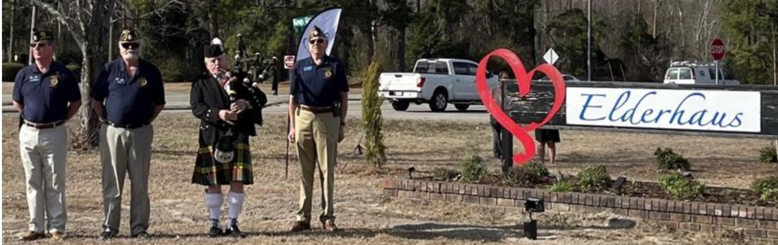
Elderhaus Flag Raise: Feb 17th