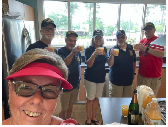
<< Pancake Breakfast