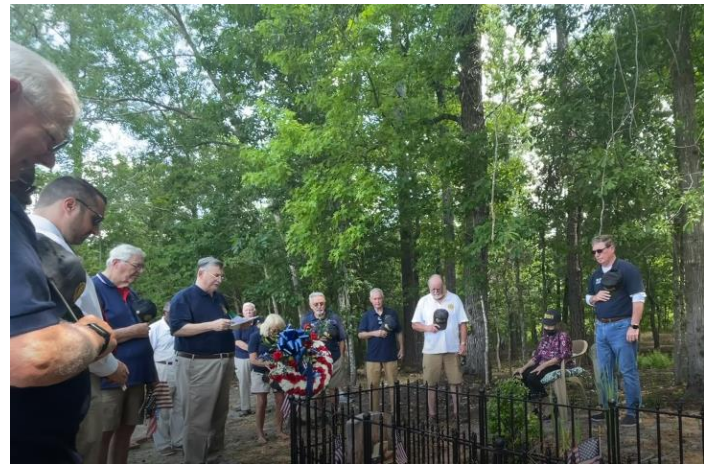
Honoring the fallen