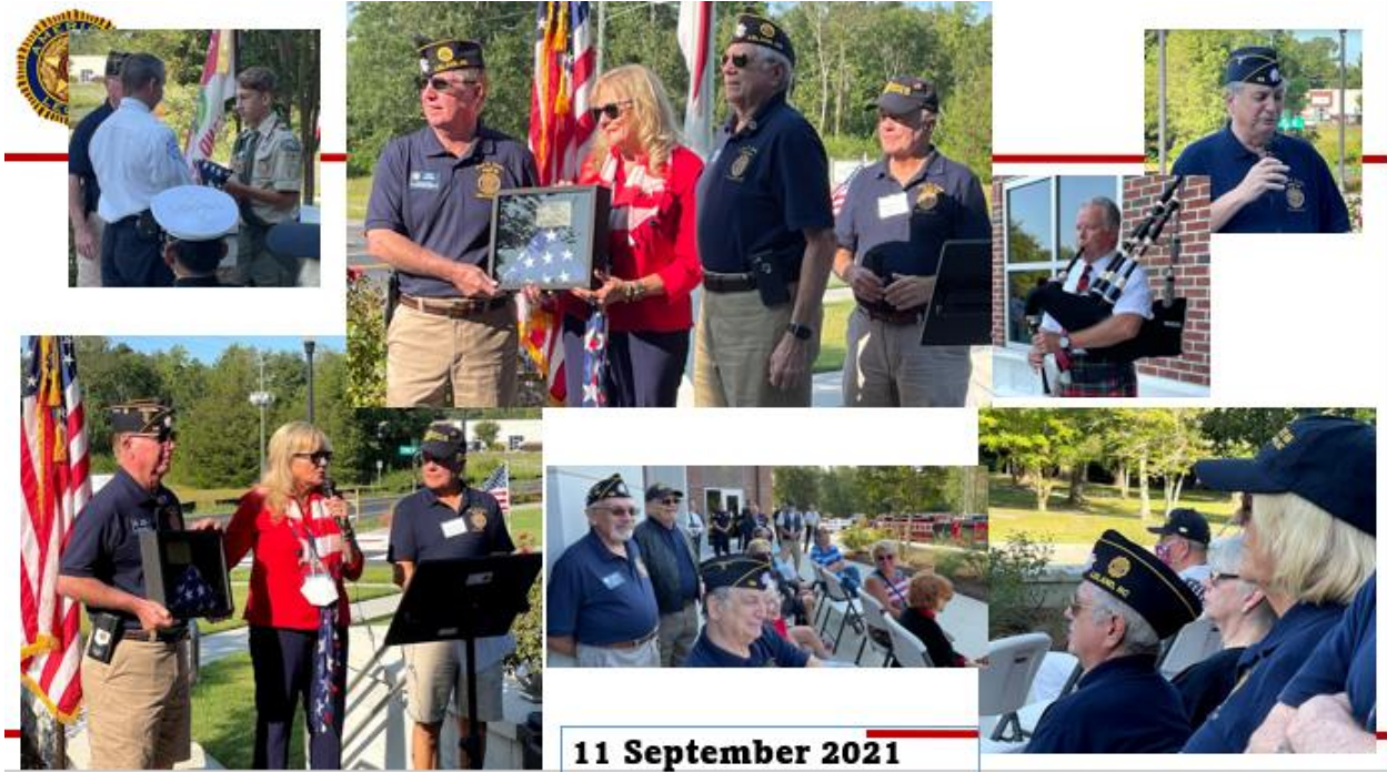
Photos from our 9-11 memorial event.