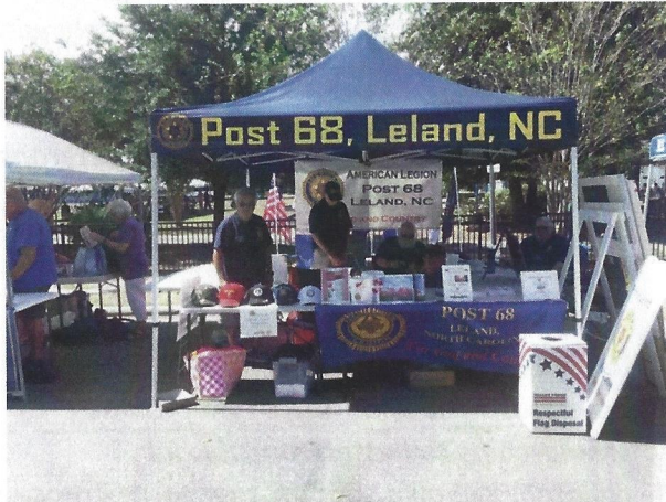
LELAND FOUNDERS DAY