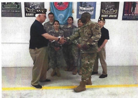
SUPPORTING NORTH BRUNSWICK HS JROTC SHOOTING TEAM