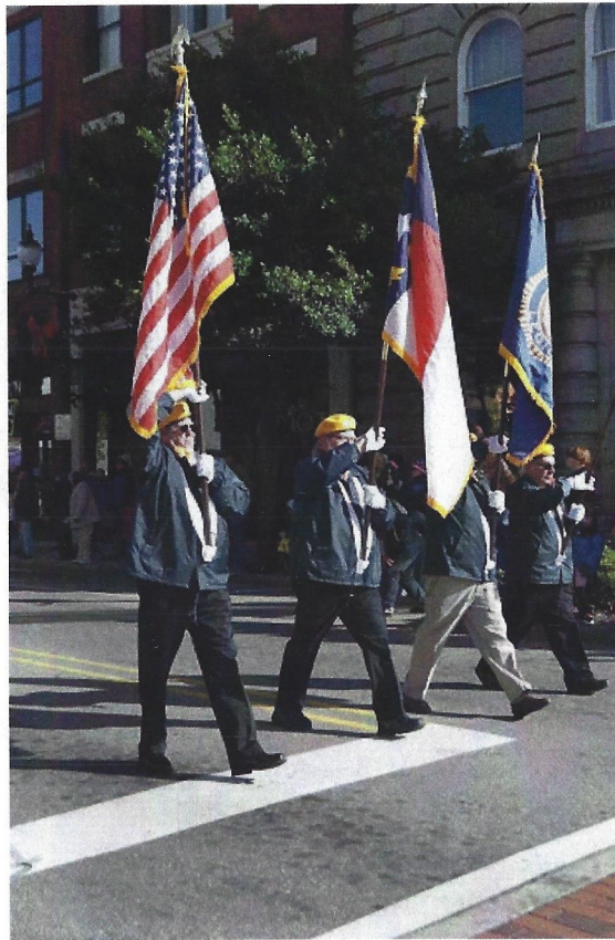
VETERANS DAY PARADE COLOR GUARD