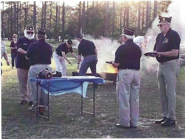
FLAG RETIREMENT CEREMONY